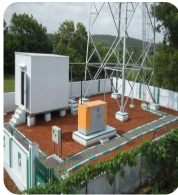
TELECOM TOWERS & SHELTERS