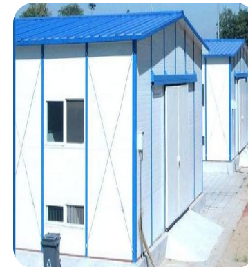
PREFABRICATED / PUF STRUCTURES