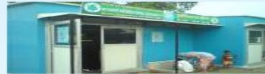
R.O PLANT ENCLOSURE