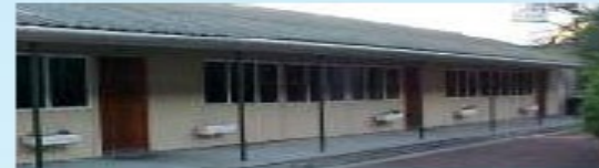
PRIMARY HEALTH CENTER